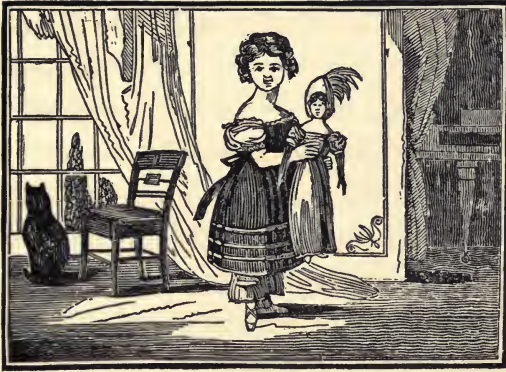
A Child and her Doll